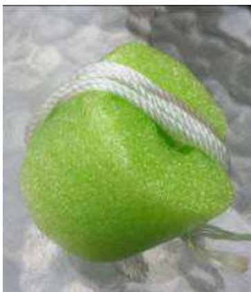
Fanwort Noodle Marker

Fanwort reproduces by fragmentation. Swimming or boating in an area with Fanwort could cause the plant to fragment & spread.